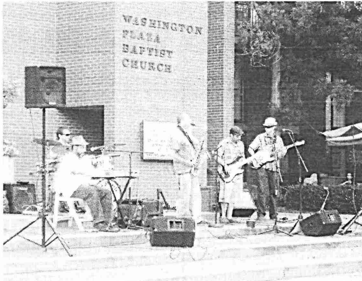
The Swingin' Swamis perform at the Lake Anne Village Center as part of the Take a Break Concert Series.